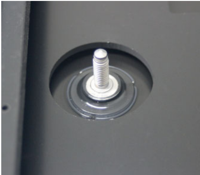
Bonded ONsert® in a display of kessler systems