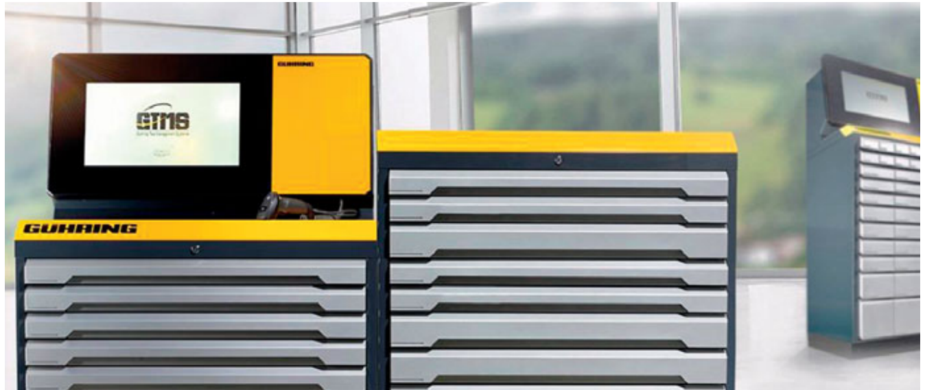
Touch display made by kessler systems on a tool dispensing system of Gühring

One customer is Gühring KG, based in the Swabian town Albstadt-Ebingen.