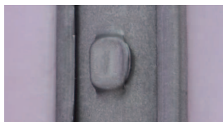
Assembled pocket filters clinching point