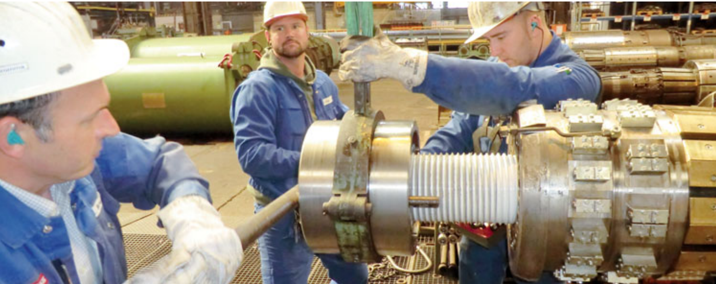
The HELICOIL® thread insert is screwed on